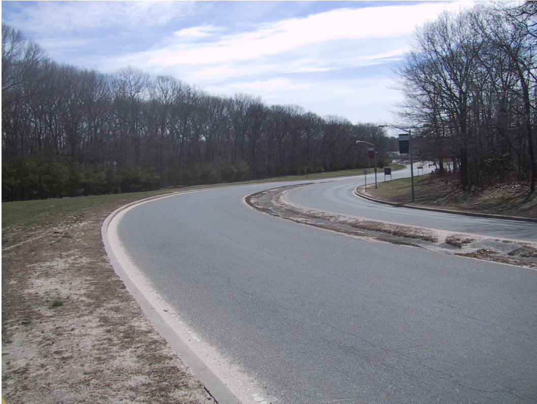
Figure 3: The view south from the end of Daniel Webster Drive along Health Sciences Drive towards the hospital. Note the lack of shoulders. The culvert is on the right, about 15 yards up the road. Traffic permitting, it is possible to ride through this without dismounting to reach the southbound lanes.

Note that students living in the Chapin Apartments often walk through the loading dock on their way to/from west campus.