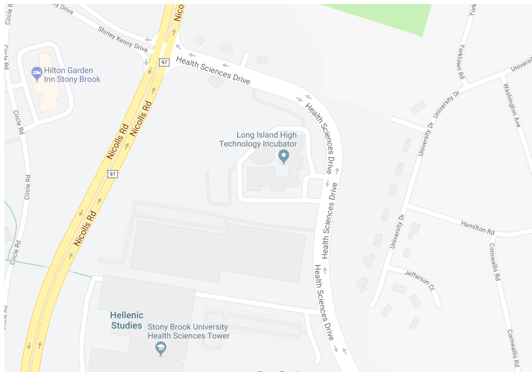
Figure 1: A map of the area under discussion. North is up. Daniel Webster Drive is not marked, but runs west from University Drive to Health Sciences Drive. The narrow section is pedestrian-only.

Bicycles must ride on the road with traffic. There is no pedestrian crossing at Nicolls Rd. on the north side, so westbound bicyclists must either cross with vehicular traffic or cross to the south side of Health Sciences Drive, where they can activate the pedestrian crossing signal. The traffic lights at Nicolls Rd. are activated by in-ground sensors, but there is no bicycle trigger. Outside of rush hours, there can be times when the light does not permit crossing east to west on the north side of Health Sciences Drive.