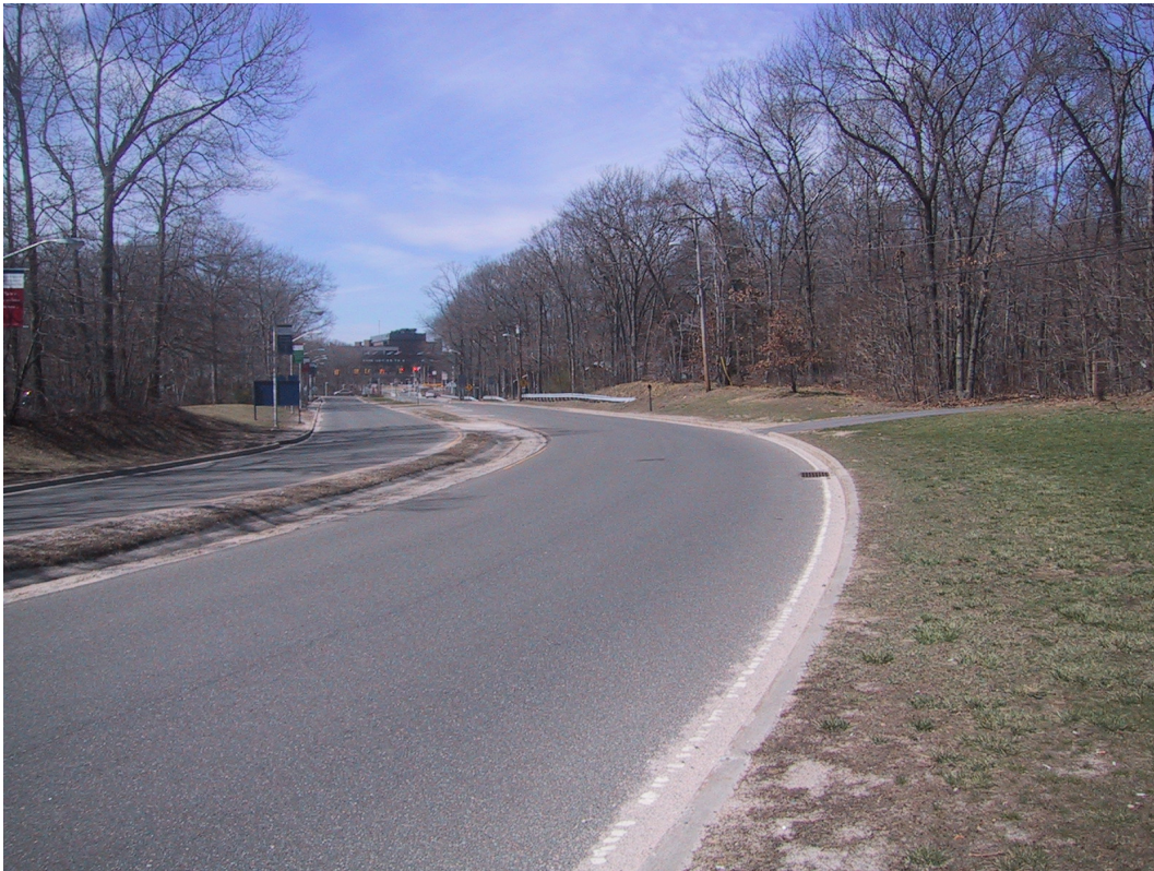
Figure 2: The view west from the end of Daniel Webster Drive towards the main entrance to campus. Note the lack of any significant shoulders.