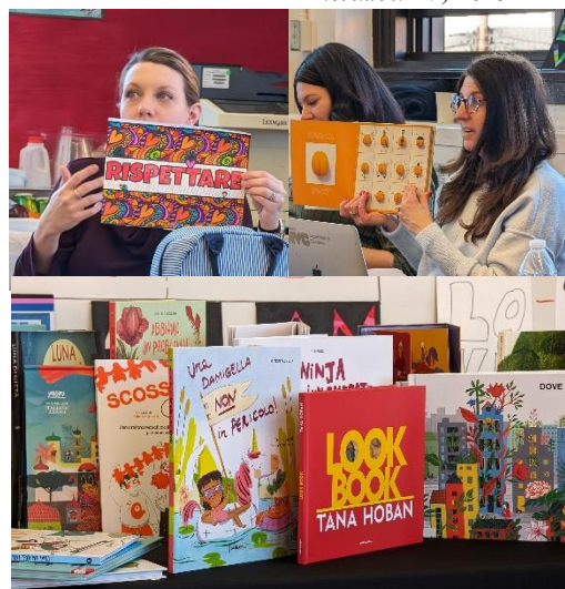
Top: NYC schoolteachers participating in the CIVIS workshop held at P.S. 112 in Brooklyn, NY on February 5, 2024