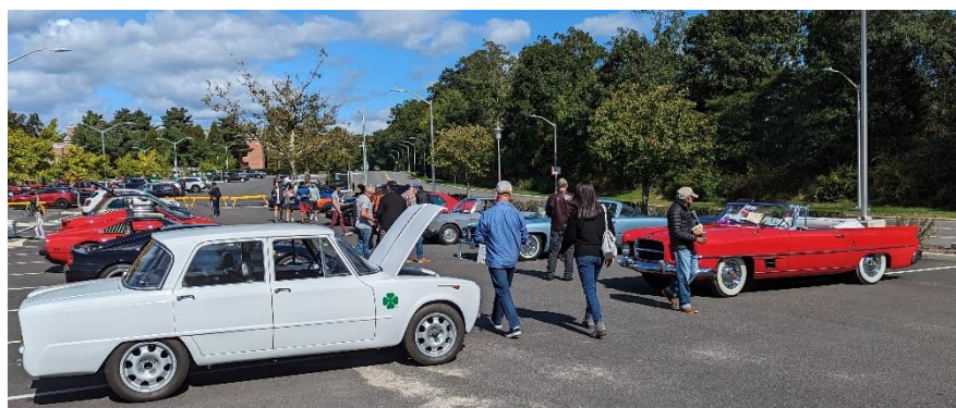
A 1969 Alfa Romeo Giulia 1300ti TS and a 1957 Dual-Ghia at the XVII Robert D. Cess Concorso d'Eleganza, October 8, 2023