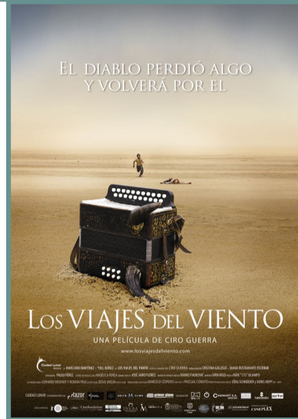
The wind journeys (2009)