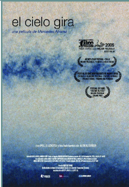
The sky turns (2005)