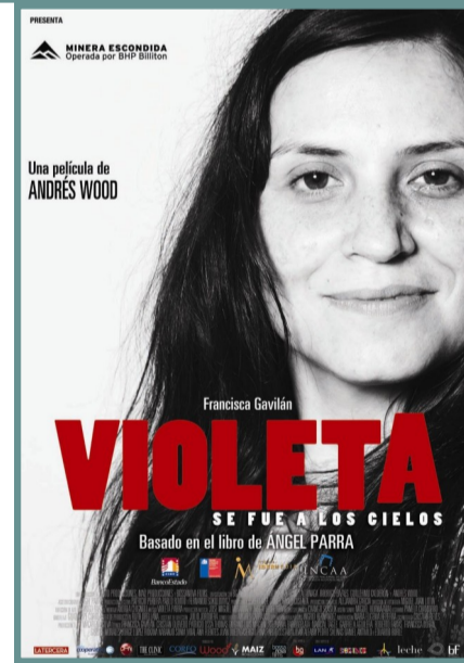
Violeta went to heaven (2011)