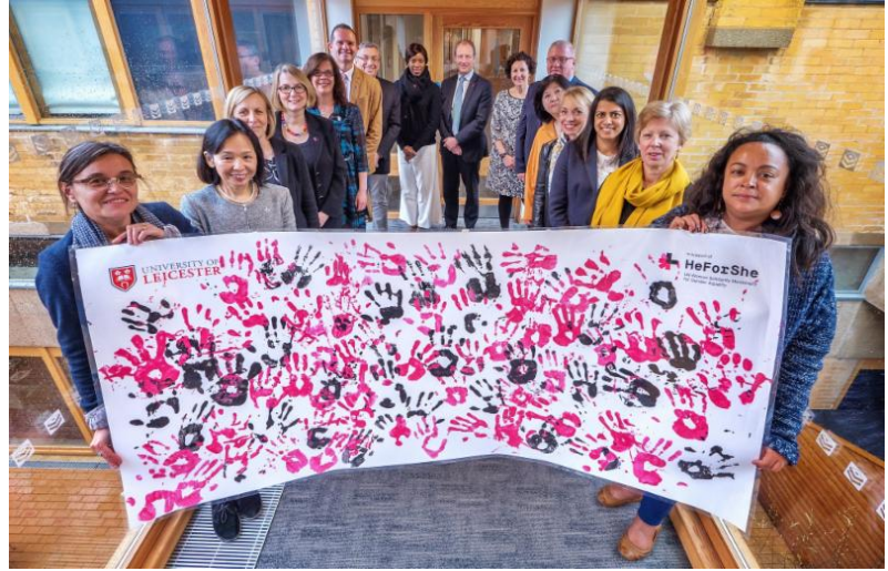
HeForShe University IMPACT Champions meet at the University of Leicester.