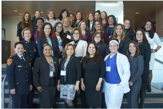
Nearly 40 women from a variety of professions offered their time and encouragement.

Recently, the University offered another program to demonstrate its enduring commitment to diversity and inclusion by encouraging local high school students to achieve their full potential. On Monday, March 6, 2017, more than 240 young women and their 21 chaperones from nine Long Island high schools packed the Stony Brook University Student Activities Center to attend the 2017 Women's Conference: "Women Leaders Paving the Way for Young Women." The message to the students was direct and clear - education can transform your life.