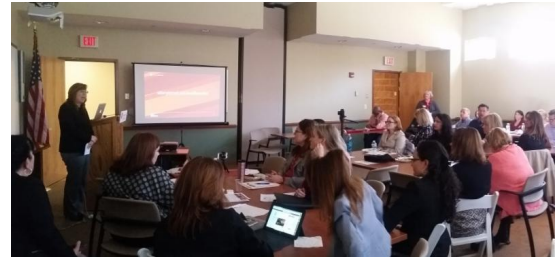
Local businesses and food entrepreneurs packed the multipurpose room to hear business builder information from the University.

Stony Brook University, the economic engine of Long Island, offers many ways for businesses to improve their bottom line. On March 9, 2017, University staff held a presentation at the Stony Brook University Business Incubator at Calverton and Agriculture Consumer Science Center (ACSC) in partnership with the Riverhead Chamber of Commerce entitled "Grow Your Business with Stony Brook University."